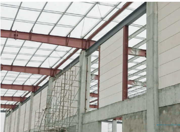
The new plant of Sichuan Gaoyu building materials Co., Ltd. in Chengdu, Sichuan Province of China

To speed up resource integration, Gaoyu Group decided to vigorously develop the prefabricated green building materials business and establish Sichuan Gaoyu building materials Co., Ltd. in Chengdu, Sichuan Province, to produce AAC products. After intensive investigation and research, in 2019, Gaoyu signed an agreement with Keda Suremaker to purchase an automatic AAC block/panel production line with an annual output of 300,000 m 3 . Since the company already has a dry mixed mortar production line, the new AAC production has to be built in an area separated from the original plant. Ingenious planning is highly encouraged for the plant layout design.