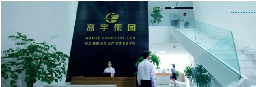
Entrance area of the Headquarters of Gaoyu Group

With the strong support of the Chinese government, the prefabricated construction industry entered a “Golden Age” of rapid development. It is estimated that up to 15% of new buildings will be prefabricated buildings until the end of 2020 and up to 30% until the end of 2025. Sichuan Province of China is actively promoting the innovation of construction, in which some enterprises with strong comprehensive strength are vigorously promoting the application of new prefabricated construction. With the development of prefabricated steel structures, the production and application technology of AAC panels gradually plays an important role in the construction market.