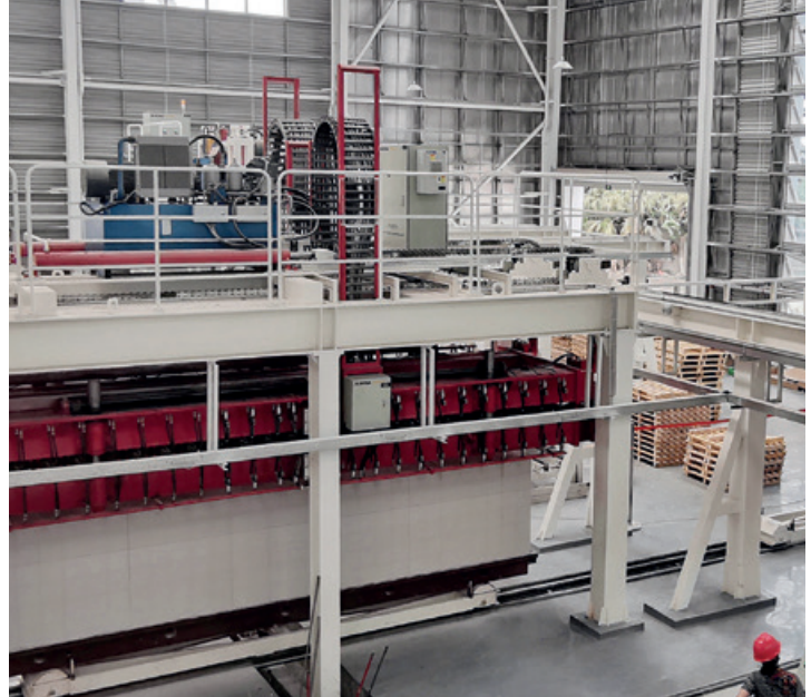
The packing line