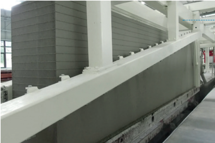
The horizontal cutting machine

The horizontal cutting machine has two cable-stayed beams aligned parallel to each other. On each one of these two beams several small columns are lined up in regular intervals to each other. A steel cutting wire is attached to a small column on one beam and stretched to the respective small column that is positioned at the same height on the other beam. Accordingly each “pair of small columns” on the two beams is used to hang only one steel wire, which means that there will be only one cutting kerf settlement (0.6~0.8 mm) on one vertical plane during the cutting process, so that the gravity settlement crack impact will be lessened when producing thin panel. Even when producing 5 cm thin panel and therefore cutting the cake over the entire length of the mould, only one steel wire is needed to be hung on each pair of “wire hanging columns” – the settlement at the same position has only one cutting gap, which effectively solves the defect of cutting crack of thin panel. In addition, obviously less friction will be caused when the cutting wire is about to leave the cake.