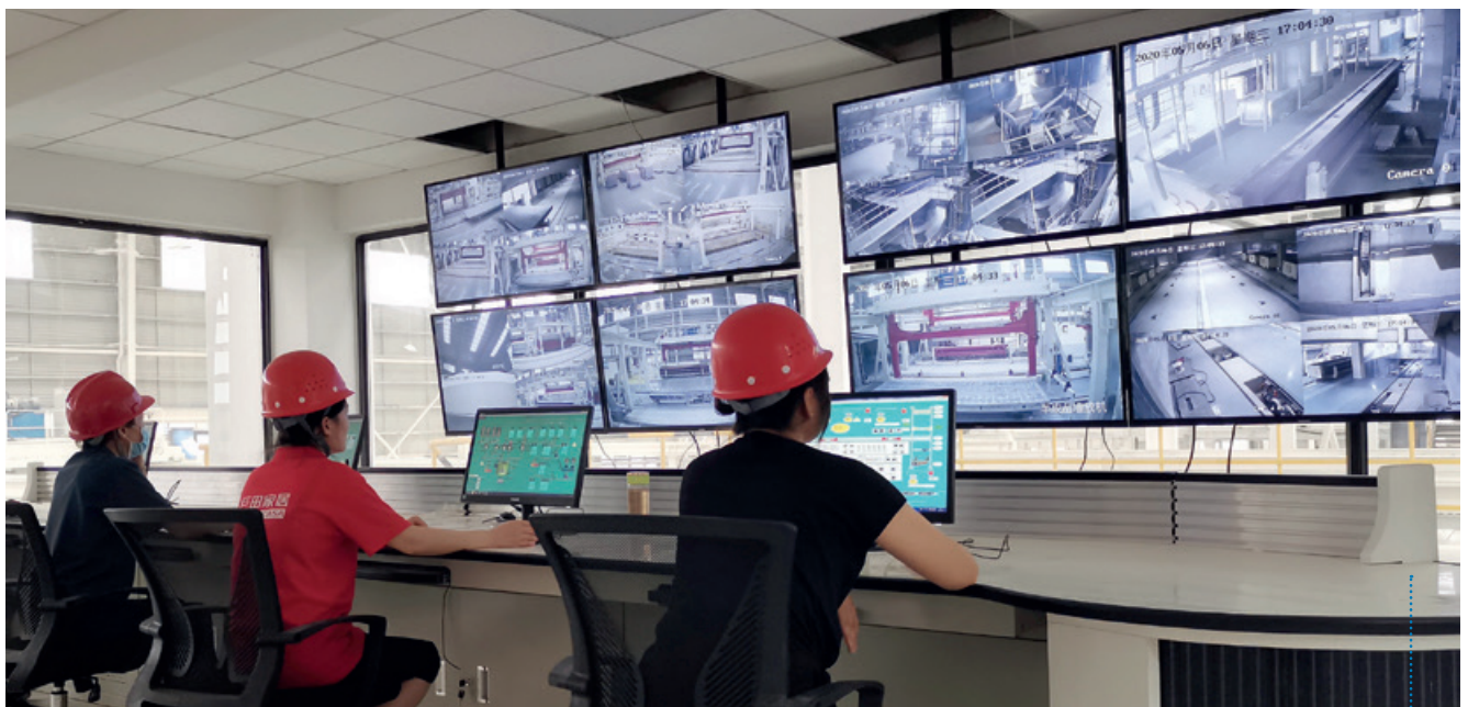
Central control room for the monitoring of the whole production process

As a leading brand in China's AAC industry, Keda Suremaker is committed to advanced technical innovation and customized design to achieve a win-win situation for its clients all over the world. With its special R&D test center, Keda Suremaker can do raw material analyses and offer its customers a customized concrete mix.